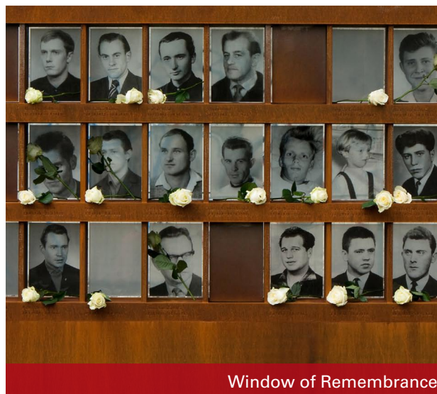
Window of Remembrance

The ceremony aims towards giving comfort to those close to the deceased, to provide a forum for public remembrance at this historic site, and to strengthen the public memory of those that fell victim to the Berlin Wall. Townspeople and visitors to Berlin, men and women, young and old, friends and family of the victims are welcome to attend the ceremonies.