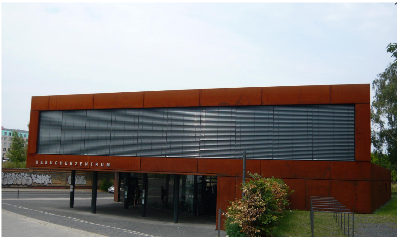
Visitors' Centre on Bernauer Straße 119, on the corner of Gartenstraße