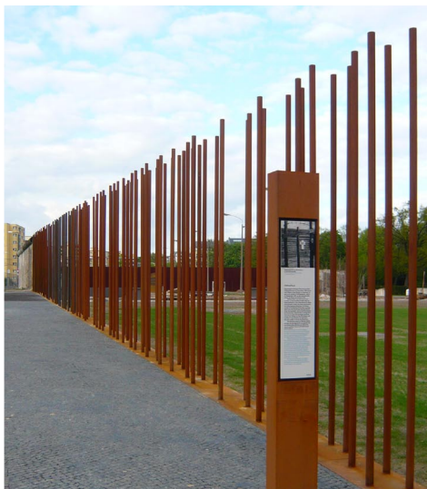
The path the Wall took