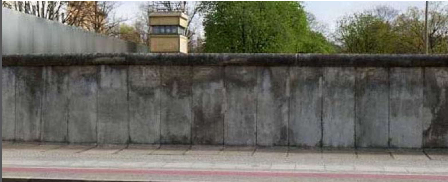
Remains of the frontier installations used in the Memorial

Between August 13, 1961, and November 9, 1989, the Berlin Wall cut an unrelenting gash through the whole of downtown Berlin in an attempt to prevent the citizens of East Berlin and the GDR from fleeing to the West. The Wall never completely succeeded in cutting off the stream of escapees; the SED party regime that ruled the GDR added a variety of border security installations after August 13, 1961, resulting in a multi-tiered closed-frontier system. In the West, the frontier strip was known as the Todesstreifen, or „death strip“ due to its death toll of a hundred and thirty-six. The Berlin Wall that the SED had so long used in its attempt to cement its stranglehold on the people of East Germany fell with the collapse of the GDR in 1989, ushering in the dictatorship’s ultimate demise.