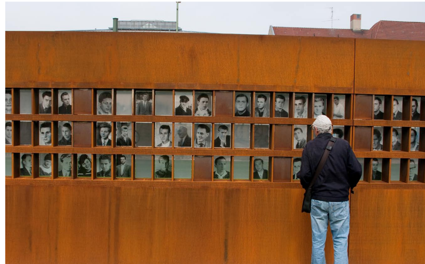
Fenster des Gedenkens (Window of Remembrance) – a place to remember the deaths at the Wall

The Berlin Wall Memorial is a central memorial site in remembrance of a Germany divided. Located in the middle of the country’s capital city, the Memorial will run either side of the former frontier strip for 1.4 km, or just under a mile, at the historic Bernauer Straße site. The last remaining part of the Berlin Wall in all its tiered structure located on the Memorial area gives visitors an impression of what the frontier installations looked like at the end of the eighties, with remnants and traces of the installations as well as the dramatic events that took place here to illustrate the history of the divided nation.