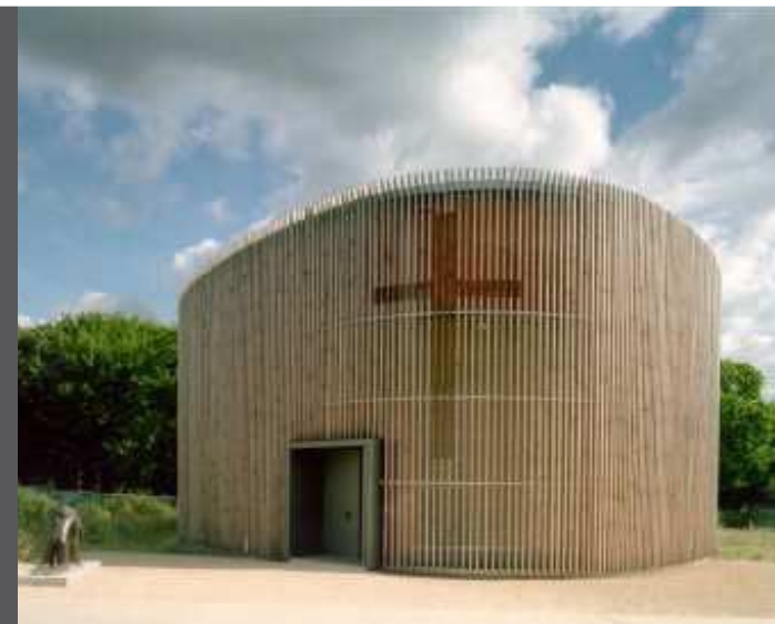
Chapel of Reconciliation in 2008

The tenth anniversary of the Fall of the Wall saw the topping-out ceremony of the Chapel of Reconciliation in 1999. The old church dating back to 1894 was on the death strip after 1961 – inaccessible to its parishioners – and a new community centre was built for the orphaned parish on Bernauer Straße in 1965; the church on the death strip was dynamited in 1985. After the Wall fell in 1989, the death-strip property was returned to the parish on condition that it would be used as a church. The bells from the old church were rescued and returned for use in their original home in the new chapel, as was the old retable.