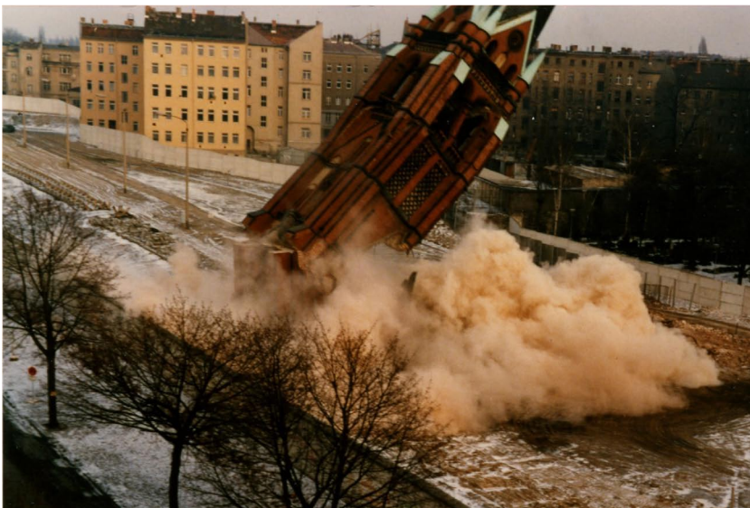
Dynamiting the Church of Reconciliation in 1985