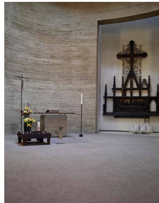
Chapel of Reconciliation in 2008