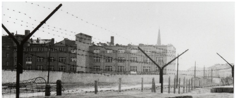
Frontier installation at Bernauer Straße 1965/1966

Researching the Wall, its history and the people in East and West that suffered from the division – and those that served the division – is an important task for the Berlin Wall Memorial. This involves collecting, organising and documenting the relevant facts, and preparing them for public presentation. This is a task for the research and documentation department of the Memorial.