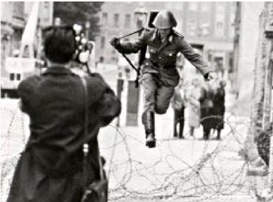
Border guard Hans Conrad Schumann jumps the barrier after the construction of the Berlin Wall at Ruppiner Straße, August 15, 1961

Including eye witnesses is especially important in developing awareness; however, the directness of face-to-face contact with those with living memory of events will not always be possible, so collecting and preserving eye-witness reports for the historical record takes an important part in the work of the Memorial.